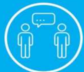
Wellbeing of staff and customers