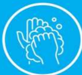
Hygiene and cleaning